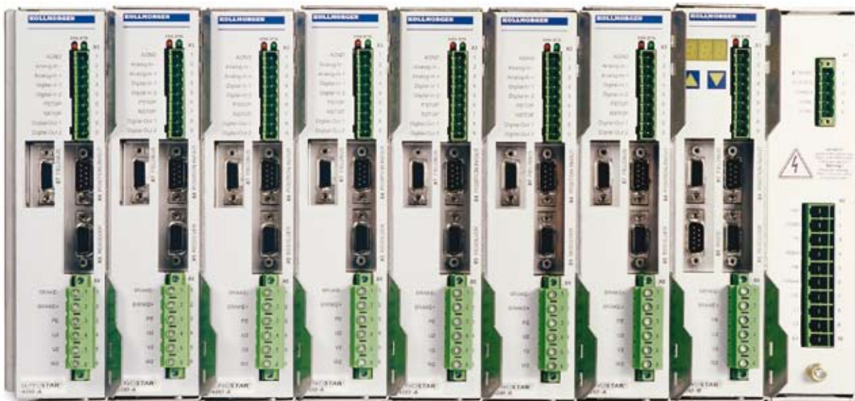
SERVOSTAR® 400 8 Axis