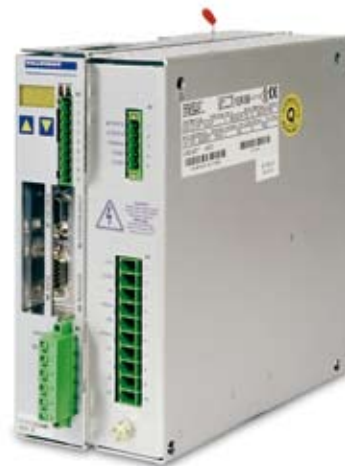
SERVOSTAR® 400 M