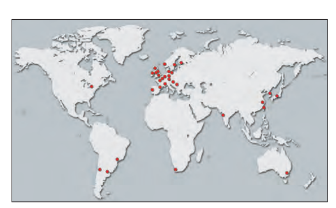
We distribute our products worldwide and promise prompt delivery backed by a rock-solid guarantee of satisfaction.

Today, we are the world's largest oscillating booster producer, with solutions for pressures up to 5,000 bar, flows up to 70 l/min and almost every fluid media. Customized solutions are also available.